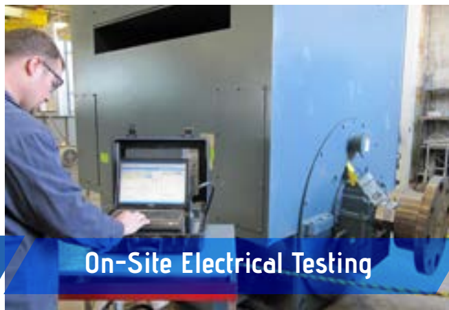
On-Site Electrical Testing