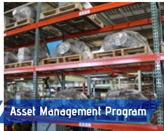
Asset Management Program