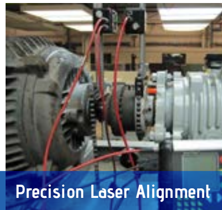
Precision Laser Alignment