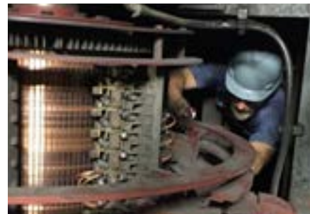
Large AC & DC Preventative Maintenance